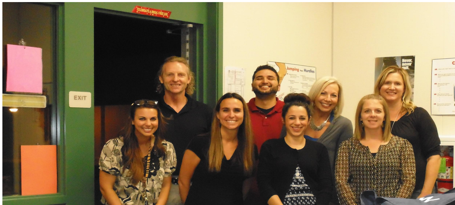
Photo from parent night on the ABC's of bullying